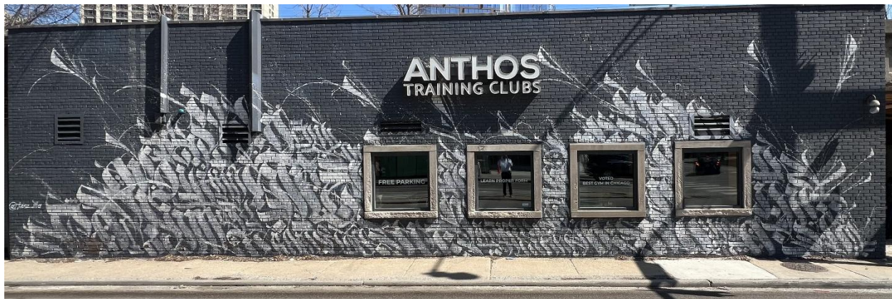
Anthos - METRA Wall at 5299 S. Lake Park Avenue – Photo Credit: Rod Sawyer

SSA #61/SECC is looking for an artist to create a mural at 5297 S. Lake Park Avenue. This is a wall adjacent to another mural, Anthos, on Lake Park Avenue. The wall belongs to Metropolitan Rail, or METRA, under the Northern Illinois Transportation Authority (NITA).