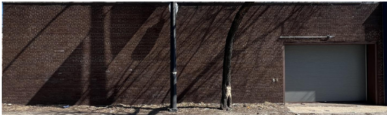
Blank Wall - METRA Wall at 5297 S. Lake Park Avenue – Photo Credit: Rod Sawyer

We encourage all artists to visit the site to assess equipment and material needed to prepare and install the mural at the site above.