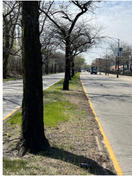
South after Curb Cut