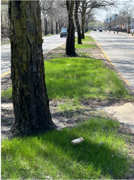
North before Curb Cut